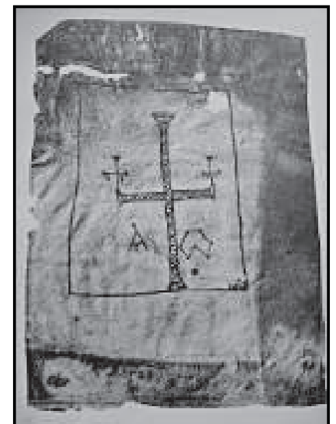
Gospel of Saint Peter.

This new worldview of apocalypticism was dualistic (there are two forces in the world: good and evil, God and the Devil) and pessimistic (things are going to get worse in this world until, literally, all hell breaks out), yet it affirmed the ultimate sovereignty of God (he would soon enter into judgment with the forces of evil to bring in his good kingdom on earth). One of the ways apocalyptic thinkers expressed their views was through a kind of writing called an "apocalypse." In general, genre consisted of pseudonymous this writings that narrated a revelation given by God through a heavenly mediator (e.g., an