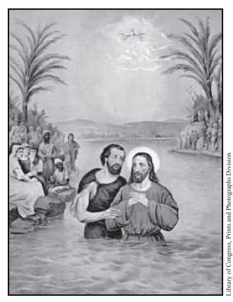
Baptism of Christ.

The Ebionites also differed from other Christians in that they insisted on remaining Jewish. But they also denied that Jesus